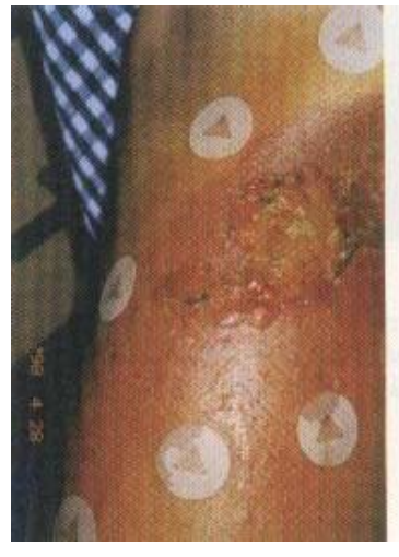
April 28, 98 Received a sevier burn with a spilled boiled water. Causing her to cry in tears. One quickly spray of EM-X instantly solved the pain problem. Treatment: EM-1 50ml 3 times a day EM-X several sprays a day