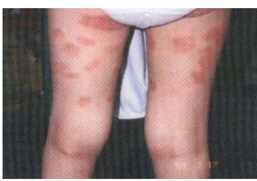
February 17, 01 Suffering from itchy attacks all over the body. EM treatment: EM-1 10ml/day, EM-X spray several times a day