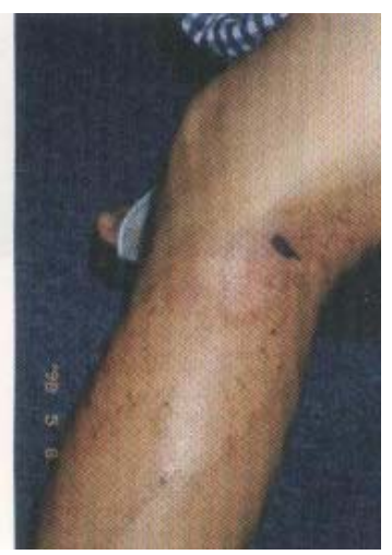
May 8, 98 Close to complete core except scabs against the prediction of a local keloid by a dermatologist